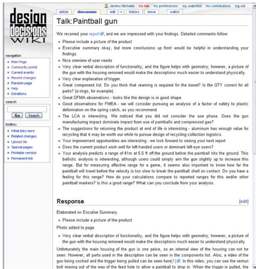
Figure 3. Screen shot of an example of feedback on a student report

After submitting the report, Professor Michalek used the "talk" page of each report to provide feedback and ask for clarification and additional information. Student teams then responded to this feedback by editing the report and responding point-by-point to each comment. Figure 3 shows an example of this feedback. This feature enabled meaningful interaction and improvement for each team on an open-ended project assignment, and it initiated a dialogue between student teams and the instructor.